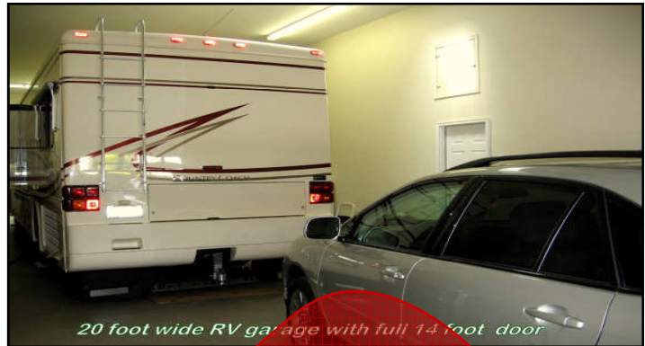
20 foot wide RV garage with full 14 foot door