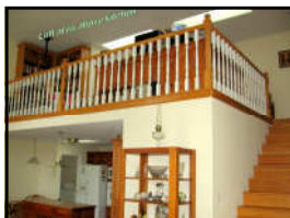
Call in for stairs kitchen