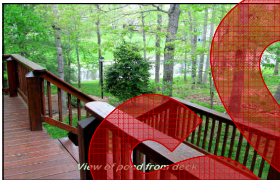
View of pond from deck