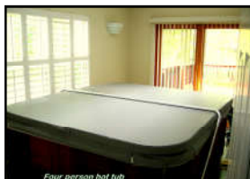
Four person hot tub