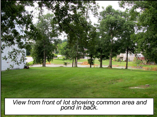
View from front of lot showing common area and pond in back.

Crossville TN 38555 -- In The Gardens RV Village