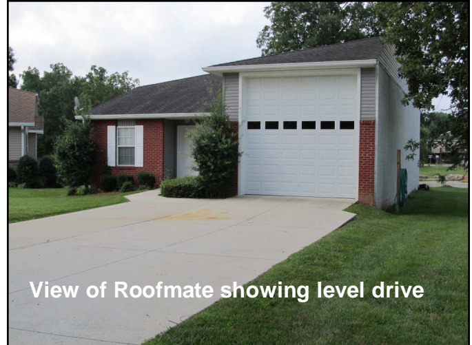
View of Roofmate showing level drive