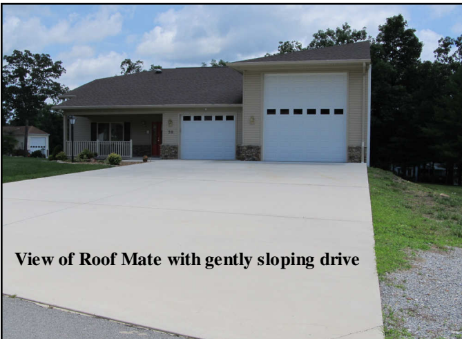
View of Roof Mate with gently sloping drive