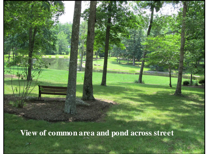
View of common area and pond across street