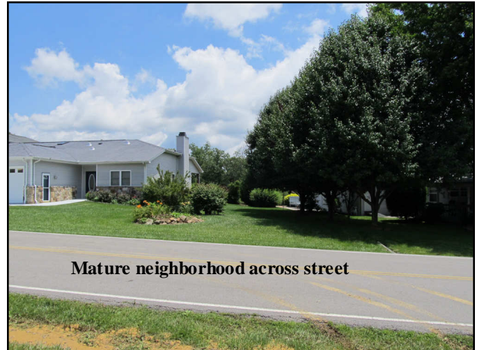
Mature neighborhood across street