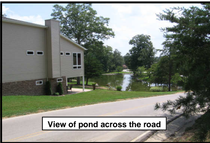
View of pond across the road