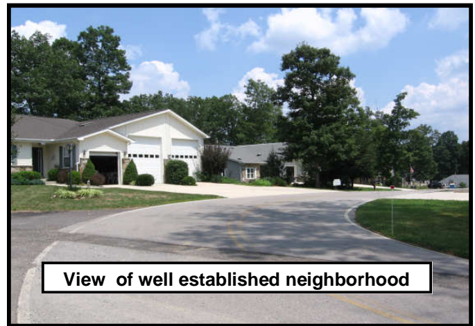
View of well established neighborhood