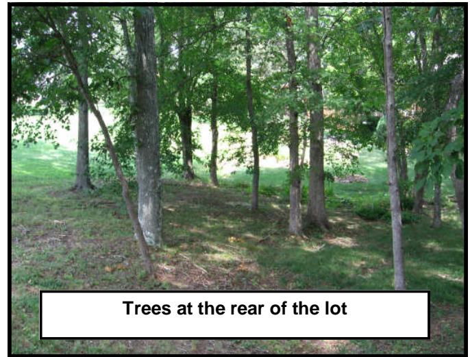
Trees at the rear of the lot