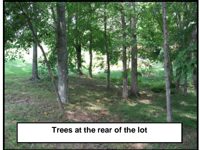
Trees at the rear of the lot