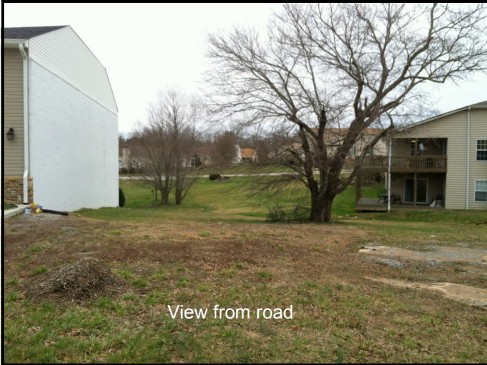
View from road

Crossville TN 38555 -- In The Gardens RV Village