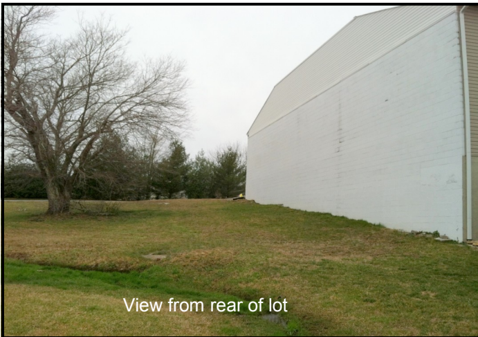
View from rear of lot