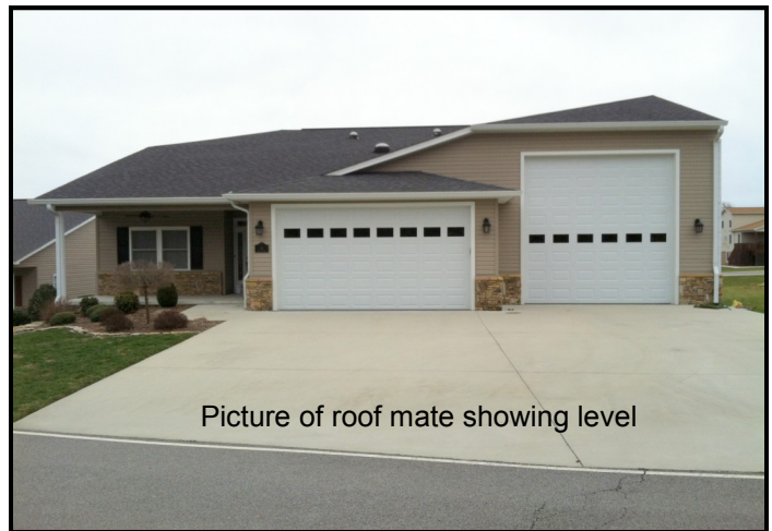
Picture of roof mate showing level